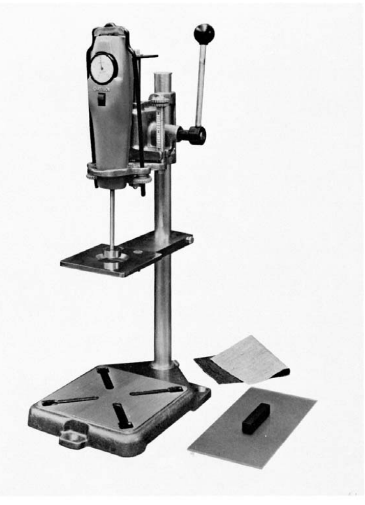
FIG. 1 King Manual Operated Dial Model

6.1.3 Force-Measurement Gage , dial or digital type (see 9.3).